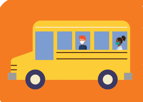
Try to sit away from other students on the bus, unless they live with you.

Follow directions for entering and moving around your school. Signs show you where to walk, and some passageways may be one-way.